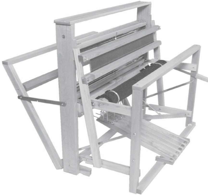
Jack-Type 4 Shaft

1009-0000 Jack-Type 4 Shaft Loom $2295.00 1009-0008 Jack-Type 8 Shaft Loom $3250.00