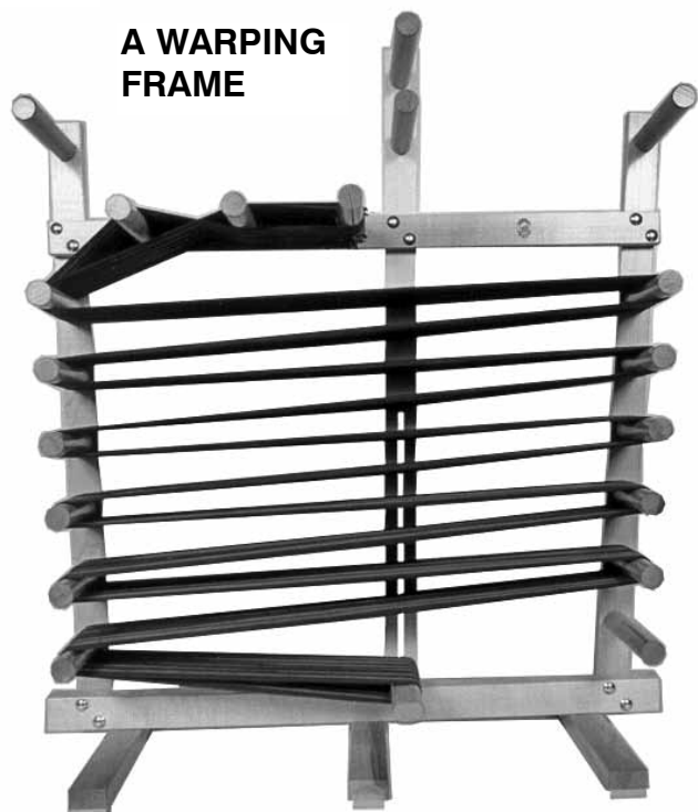
A WARPING FRAME

A floor standing INKLE Loom, to weave strips of fabric up to 6" wide and 16 feet long. Designed for continuous string heddles which are made in minutes. The heddle length is adjustable by turning the heddle carrier.