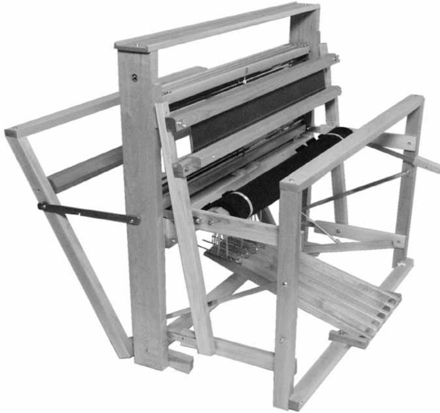
Jack-Type 4 Shaft

1009-0000 Jack-Type 4 Shaft Loom $1760.00 1009-0008 Jack-Type 8 Shaft Loom $2250.00